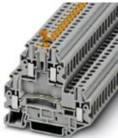
Knife disconnect terminal block, for mounting on NS 35... DIN rail, color: gray, with test socket screws

Please be informed that the data shown in this PDF Document is generated from our Online Catalog. Please find the complete data in the user's documentation. Our General Terms of Use for Downloads are valid ( http://phoenixcontact.com/download )