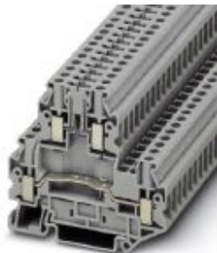
Disconnect terminal block, for mounting on NS 35 DIN rail, with test socket screws, color: gray

Please be informed that the data shown in this PDF Document is generated from our Online Catalog. Please find the complete data in the user's documentation. Our General Terms of Use for Downloads are valid ( http://phoenixcontact.com/download )