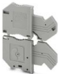
End cover, Right / left, length: 49.4 mm, width: 5 mm, height: 26.9 mm, color: gray

Please be informed that the data shown in this PDF Document is generated from our Online Catalog. Please find the complete data in the user's documentation. Our General Terms of Use for Downloads are valid ( http://phoenixcontact.com/download )