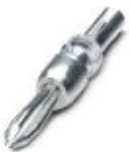
Test plugs, with solder connection up to 1 mm 2 conductor cross section, color: gray