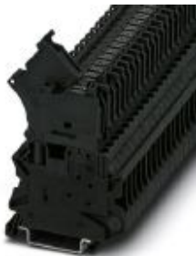
Lever-type fuse terminal block, black, for 5 x 20 mm G fuse inserts, with LED for 250 V AC

Please be informed that the data shown in this PDF Document is generated from our Online Catalog. Please find the complete data in the user's documentation. Our General Terms of Use for Downloads are valid ( http://phoenixcontact.com/download )