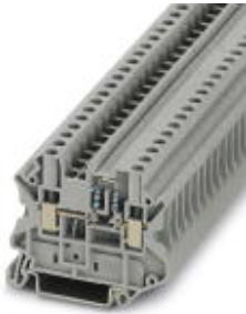
Component terminal block, nominal current: 32 A

Please be informed that the data shown in this PDF Document is generated from our Online Catalog. Please find the complete data in the user's documentation. Our General Terms of Use for Downloads are valid ( http://phoenixcontact.com/download )