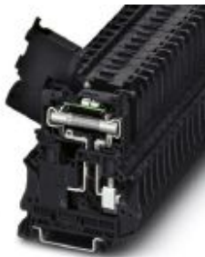
Lever-type fuse terminal block, color: black, for 6.3 x 32 mm G fuse inserts, with LED for 250 V AC

Please be informed that the data shown in this PDF Document is generated from our Online Catalog. Please find the complete data in the user's documentation. Our General Terms of Use for Downloads are valid ( http://phoenixcontact.com/download )