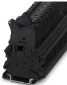
Lever-type fuse terminal block, black, for 5 x 20 mm G fuse inserts, with LED for 24 V DC

Please be informed that the data shown in this PDF Document is generated from our Online Catalog. Please find the complete data in the user's documentation. Our General Terms of Use for Downloads are valid ( http://phoenixcontact.com/download )