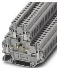
Component terminal block, with integrated diode, connection method: Screw connection, cross section: 0.14 mm 2 - 4 mm 2 , AWG: 26 - 12, width: 5.2 mm, color: gray, mounting type: NS 35/7,5, NS 35/15

Please be informed that the data shown in this PDF Document is generated from our Online Catalog. Please find the complete data in the user's documentation. Our General Terms of Use for Downloads are valid ( http://phoenixcontact.com/download )