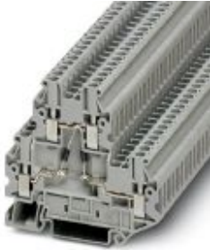
Component terminal block, with integrated diode, connection method: Screw connection, cross section: 0.14 mm 2 - 4 mm 2 , AWG: 26 - 12, width: 5.2 mm, color: gray, mounting type: NS 35/7,5, NS 35/15

Please be informed that the data shown in this PDF Document is generated from our Online Catalog. Please find the complete data in the user's documentation. Our General Terms of Use for Downloads are valid ( http://phoenixcontact.com/download )