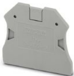
End cover, length: 47 mm, width: 2.2 mm, height: 39.8 mm, color: gray

Please be informed that the data shown in this PDF Document is generated from our Online Catalog. Please find the complete data in the user's documentation. Our General Terms of Use for Downloads are valid ( http://phoenixcontact.com/download )