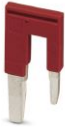
Reducing bridge, pitch: 10.2 mm, length: 29.3 mm, width: 15.1 mm, number of positions: 2, color: red

Please be informed that the data shown in this PDF Document is generated from our Online Catalog. Please find the complete data in the user's documentation. Our General Terms of Use for Downloads are valid ( http://phoenixcontact.com/download )