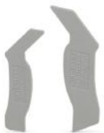
Cover segment, color: gray

Please be informed that the data shown in this PDF Document is generated from our Online Catalog. Please find the complete data in the user's documentation. Our General Terms of Use for Downloads are valid ( http://phoenixcontact.com/download )