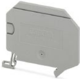
Partition plate, length: 62.1 mm, width: 2.2 mm, height: 52.5 mm, color: gray

Please be informed that the data shown in this PDF Document is generated from our Online Catalog. Please find the complete data in the user's documentation. Our General Terms of Use for Downloads are valid ( http://phoenixcontact.com/download )