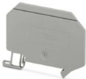
Partition plate, length: 69.7 mm, width: 2.2 mm, height: 52.5 mm, color: gray

Please be informed that the data shown in this PDF Document is generated from our Online Catalog. Please find the complete data in the user's documentation. Our General Terms of Use for Downloads are valid ( http://phoenixcontact.com/download )