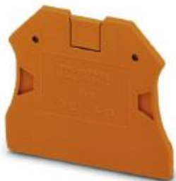
End cover, length: 47 mm, width: 2.2 mm, height: 39.8 mm, color: orange

Please be informed that the data shown in this PDF Document is generated from our Online Catalog. Please find the complete data in the user's documentation. Our General Terms of Use for Downloads are valid ( http://phoenixcontact.com/download )