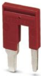
Reducing bridge, pitch: 9.5 mm, length: 24.6 mm, width: 14.5 mm, number of positions: 2, color: red

Please be informed that the data shown in this PDF Document is generated from our Online Catalog. Please find the complete data in the user's documentation. Our General Terms of Use for Downloads are valid ( http://phoenixcontact.com/download )