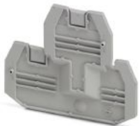
End cover, length: 69.9 mm, width: 2.2 mm, height: 57.5 mm, color: gray

Please be informed that the data shown in this PDF Document is generated from our Online Catalog. Please find the complete data in the user's documentation. Our General Terms of Use for Downloads are valid ( http://phoenixcontact.com/download )