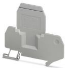
Partition plate, length: 74.3 mm, width: 2.2 mm, height: 70 mm, color: gray

Please be informed that the data shown in this PDF Document is generated from our Online Catalog. Please find the complete data in the user's documentation. Our General Terms of Use for Downloads are valid ( http://phoenixcontact.com/download )