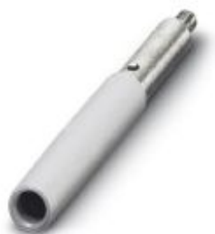
Female test connector, color: gray

Please be informed that the data shown in this PDF Document is generated from our Online Catalog. Please find the complete data in the user's documentation. Our General Terms of Use for Downloads are valid ( http://phoenixcontact.com/download )