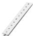
Marker for terminal blocks, Strip, white, labeled, can be labeled with: CMS-P1-PLOTTER, horizontal: L1, L2, L3, N, PE, L1, L2, L3, N, PE, mounting type: snap into tall marker groove, for terminal block width: 10.2 mm, lettering field size: 10.15 x 10.5 mm, Number of individual labels: 10

Marker for terminal blocks - ZB10,LGS:L1-N,PE - 1053412