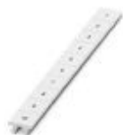
Zack marker strip, Strip, white, labeled, can be labeled with: CMS-P1-PLOTTER, Printed vertically: consecutive numbers 1 ... 10, 11 ... 20, etc. up to 91 ... 100, mounting type: snap into tall marker groove, for terminal block width: 10.2 mm, lettering field size: 10.15 x 10.5 mm, Number of individual labels: 10

Zack marker strip - ZB10,QR:FORTL.ZAHLEN - 1053027