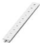
Zack marker strip, Strip, white, labeled, can be labeled with: CMS-P1-PLOTTER, printed horizontally: consecutive numbers 1 ... 10, 11 ... 20, etc. up to 91 ... 100, mounting type: snap into tall marker groove, for terminal block width: 10.2 mm, lettering field size: 10.15 x 10.5 mm, Number of individual labels: 10

Zack marker strip - ZB10,LGS:FORTL.ZAHLEN - 1053014