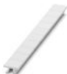
Zack marker strip, can be ordered: Strip, white, labeled according to customer specifications, mounting type: snap into tall marker groove, for terminal block width: 10.2 mm, lettering field size: 10.15 x 10.5 mm, Number of individual labels: 10

Zack marker strip - ZB10,LGS:FORTL.ZAHLEN - 1053014