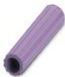
Insulating sleeve, color: violet