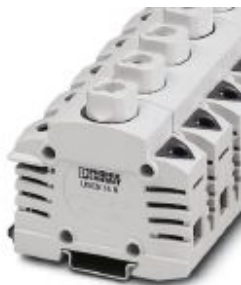
Fuse terminal blocks for NEOZED fuse inserts

Please be informed that the data shown in this PDF Document is generated from our Online Catalog. Please find the complete data in the user's documentation. Our General Terms of Use for Downloads are valid ( http://phoenixcontact.com/download )