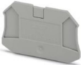
End cover, length: 64.4 mm, width: 2.2 mm, height: 42.3 mm, color: gray

Please be informed that the data shown in this PDF Document is generated from our Online Catalog. Please find the complete data in the user's documentation. Our General Terms of Use for Downloads are valid ( http://phoenixcontact.com/download )