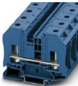
Feed-through terminal block with bolt connection method, cross section: 2.5 - 35 mm 2 , AWG: 14 - 2, width 20.2 mm, color: blue

Please be informed that the data shown in this PDF Document is generated from our Online Catalog. Please find the complete data in the user's documentation. Our General Terms of Use for Downloads are valid ( http://phoenixcontact.com/download )