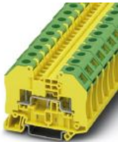
Ground terminal block with bolt connection, cross section 0.1 - 2.5 mm 2 , AWG: 26 - 14, width 12.3 mm, color: Green-yellow

Please be informed that the data shown in this PDF Document is generated from our Online Catalog. Please find the complete data in the user's documentation. Our General Terms of Use for Downloads are valid ( http://phoenixcontact.com/download )