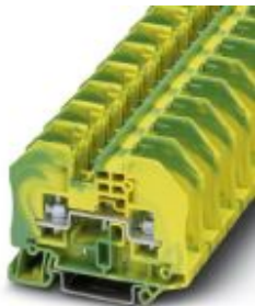
Ground terminal block with bolt connection, cross section 0.1 - 2.5 mm 2 , AWG: 26 - 14, width 12.3 mm, color: Green-yellow

Please be informed that the data shown in this PDF Document is generated from our Online Catalog. Please find the complete data in the user's documentation. Our General Terms of Use for Downloads are valid ( http://phoenixcontact.com/download )