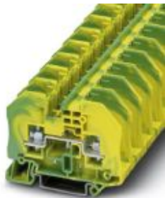
Ground terminal block with bolt connection, cross section: 0.1 - 6 mm 2 , AWG: 26 - 10, width 16.3 mm, color: Green-yellow

Please be informed that the data shown in this PDF Document is generated from our Online Catalog. Please find the complete data in the user's documentation. Our General Terms of Use for Downloads are valid ( http://phoenixcontact.com/download )