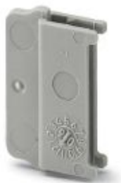
Path extension, color: gray

Please be informed that the data shown in this PDF Document is generated from our Online Catalog. Please find the complete data in the user's documentation. Our General Terms of Use for Downloads are valid ( http://phoenixcontact.com/download )