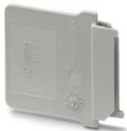
Path extension, color: gray

Please be informed that the data shown in this PDF Document is generated from our Online Catalog. Please find the complete data in the user's documentation. Our General Terms of Use for Downloads are valid ( http://phoenixcontact.com/download )