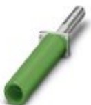
Female test connector, color: green

Female test connector - PSBJ-URTK/S GN - 0311760