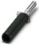
Female test connector, color: black

Female test connector - PSBJ-URTK/S BK - 0311728