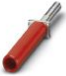
Female test connector, color: red

Female test connector - PSBJ-URTK/S RD - 0311744