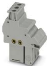
Plug, 3-pos. with integrated, automatic short circuit function

Please be informed that the data shown in this PDF Document is generated from our Online Catalog. Please find the complete data in the user's documentation. Our General Terms of Use for Downloads are valid ( http://phoenixcontact.com/download )