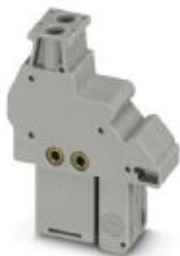
Plug, 2-pos. with integrated, automatic short circuit function

Please be informed that the data shown in this PDF Document is generated from our Online Catalog. Please find the complete data in the user's documentation. Our General Terms of Use for Downloads are valid ( http://phoenixcontact.com/download )