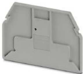
End cover, length: 53.3 mm, width: 2.2 mm, height: 37 mm, color: gray

Please be informed that the data shown in this PDF Document is generated from our Online Catalog. Please find the complete data in the user's documentation. Our General Terms of Use for Downloads are valid ( http://phoenixcontact.com/download )