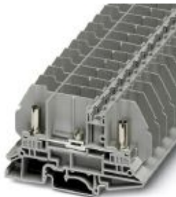
Test disconnect terminal block, cross section: 0.1 - 6 mm 2 , AWG: 26 - 8, width 13 mm, color: gray

Please be informed that the data shown in this PDF Document is generated from our Online Catalog. Please find the complete data in the user's documentation. Our General Terms of Use for Downloads are valid ( http://phoenixcontact.com/download )