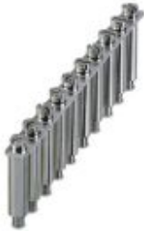
Fixed bridge, pitch: 9 mm, number of positions: 10, color: silver

Please be informed that the data shown in this PDF Document is generated from our Online Catalog. Please find the complete data in the user's documentation. Our General Terms of Use for Downloads are valid ( http://phoenixcontact.com/download )