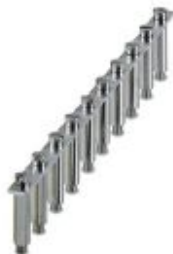
Fixed bridge, pitch: 13 mm, number of positions: 10, color: silver

Please be informed that the data shown in this PDF Document is generated from our Online Catalog. Please find the complete data in the user's documentation. Our General Terms of Use for Downloads are valid ( http://phoenixcontact.com/download )