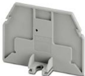
End cover, length: 53.3 mm, width: 2.2 mm, height: 37 mm, color: gray

Please be informed that the data shown in this PDF Document is generated from our Online Catalog. Please find the complete data in the user's documentation. Our General Terms of Use for Downloads are valid ( http://phoenixcontact.com/download )