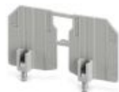
Flange cover, snap onto the UP 4/... plugs, length: 47 mm, width: 4.5 mm, height: 24.7 mm, color: gray