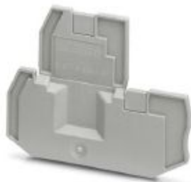
End cover, length: 74.3 mm, width: 2.2 mm, height: 66 mm, color: gray

Please be informed that the data shown in this PDF Document is generated from our Online Catalog. Please find the complete data in the user's documentation. Our General Terms of Use for Downloads are valid ( http://phoenixcontact.com/download )