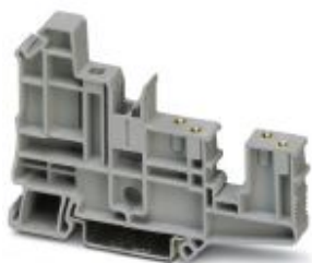
Screw flange, connection method: Screw connection, width: 8.2 mm, color: gray, mounting type: NS 35/7,5, NS 35/15

Please be informed that the data shown in this PDF Document is generated from our Online Catalog. Please find the complete data in the user's documentation. Our General Terms of Use for Downloads are valid ( http://phoenixcontact.com/download )