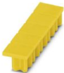
Cover for actuation shaft, 5-pos., for spring-cage terminal blocks with width of 5.2 mm

Please be informed that the data shown in this PDF Document is generated from our Online Catalog. Please find the complete data in the user's documentation. Our General Terms of Use for Downloads are valid ( http://phoenixcontact.com/download )