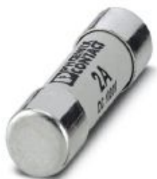
Fuse, 10.3x38 mm, up to 1000 V DC, gPV characteristics

Please be informed that the data shown in this PDF Document is generated from our Online Catalog. Please find the complete data in the user's documentation. Our General Terms of Use for Downloads are valid ( http://phoenixcontact.com/download )