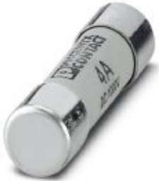
Fuse, 10.3x38 mm, up to 1000 V DC, gPV characteristics

Please be informed that the data shown in this PDF Document is generated from our Online Catalog. Please find the complete data in the user's documentation. Our General Terms of Use for Downloads are valid ( http://phoenixcontact.com/download )