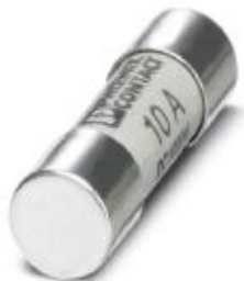
Fuse, 10.3x38 mm, up to 1000 V DC, gPV characteristics

Please be informed that the data shown in this PDF Document is generated from our Online Catalog. Please find the complete data in the user's documentation. Our General Terms of Use for Downloads are valid ( http://phoenixcontact.com/download )