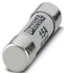
Fuse, 10.3x38 mm, up to 1000 V DC, gPV characteristics

Please be informed that the data shown in this PDF Document is generated from our Online Catalog. Please find the complete data in the user's documentation. Our General Terms of Use for Downloads are valid ( http://phoenixcontact.com/download )