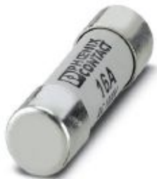
Fuse, 10.3x38 mm, up to 1000 V DC, gPV characteristics

Please be informed that the data shown in this PDF Document is generated from our Online Catalog. Please find the complete data in the user's documentation. Our General Terms of Use for Downloads are valid ( http://phoenixcontact.com/download )