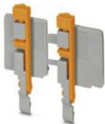
Flange cover, length: 35.8 mm, width: 4.5 mm, height: 24.7 mm, color: gray

Please be informed that the data shown in this PDF Document is generated from our Online Catalog. Please find the complete data in the user's documentation. Our General Terms of Use for Downloads are valid ( http://phoenixcontact.com/download )