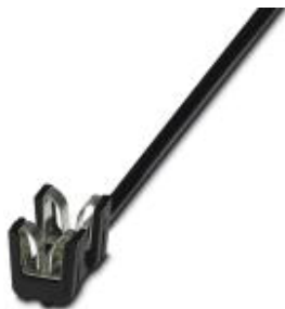
Shield connection clip, color: black

Please be informed that the data shown in this PDF Document is generated from our Online Catalog. Please find the complete data in the user's documentation. Our General Terms of Use for Downloads are valid ( http://phoenixcontact.com/download )