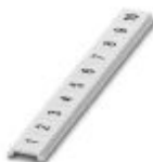
Zack Marker strip, flat, Strip, white, labeled, printed horizontally: consecutive numbers 1 ... 10, 11 ... 20, etc. up to 491 ... 500, mounting type: snap into flat marker groove, for terminal block width: 5 mm, lettering field size: 5.15 x 5.15 mm, Number of individual labels: 10

Zack Marker strip, flat - ZBF 5,LGS:FORTL.ZAHLEN - 0808671