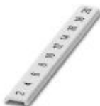
Zack Marker strip, flat, Strip, white, labeled, printed horizontally: consecutive numbers 2 ... 20, 22 ... 40, etc. up to 82 ... 100, mounting type: snap into flat marker groove, for terminal block width: 5 mm, lettering field size: 5.15 x 5.15 mm, Number of individual labels: 10

Zack Marker strip, flat - ZBF 5,LGS:GERADE ZAHLEN - 0810821