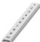
Zack Marker strip, flat, Strip, white, labeled, Printed vertically: consecutive numbers 1 ... 10, 11 ... 20, etc. up to 91 ... 100, mounting type: snap into flat marker groove, for terminal block width: 5 mm, lettering field size: 5.15 x 5.15 mm, Number of individual labels: 10

Zack Marker strip, flat - ZBF 5,QR:FORTL.ZAHLEN - 0808697